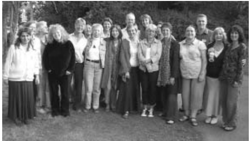
Suzuki piano teacher trainers and trainees

On the training courses, trainees learn how to introduce and reinforce teaching points effectively while building strategies and methods to overcome and correct technical,